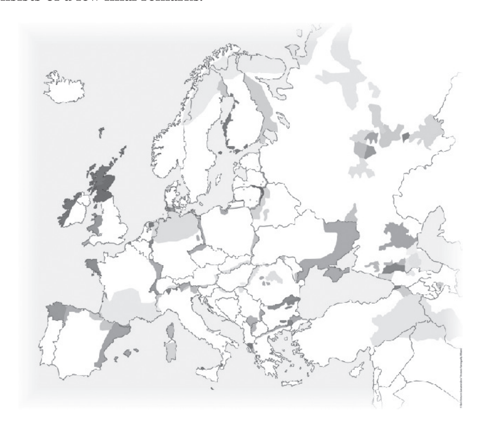
Map 1: Geographical distribution of all lesser used or non-state language areas of Europe

sociolinguistic information on the languages in the Survey and summarized results of various lexicographical aspects. In the third section some implicational statements are made. Since offering and analyzing all the data the Survey has culled in the field of lexicographical practice (and there is quite a considerable amount – it will hopefully be made generally available via the Euralex website) was simply impossible because of the limited space for this paper, I chose to concentrate on some of the results I found particularly interesting in the third section. The fourth section consists of a few final remarks.